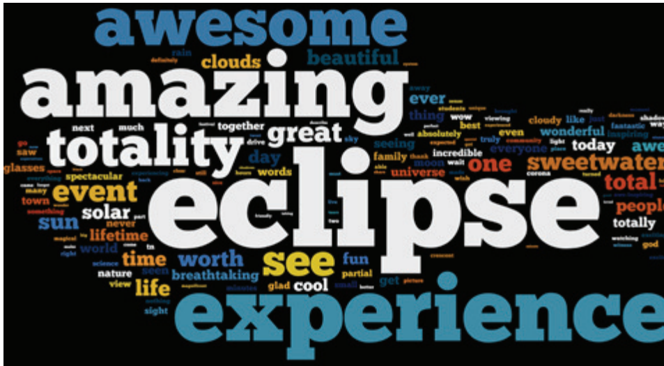
Figure 3. Word cloud generated from responses to tweet-style reaction survey item.

Finally, a word cloud was created, scaling by the frequency of different terms found in the tweet-style summary comments. The word cloud is shown in Figure 3. The word cloud generated reflects the overwhelmingly positive response to all of the eclipse events across the board.